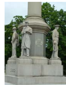
Civil War Monument, Dowagiac

For more information on these sites, as well as detailed driving instructions, refer to a copy of Historic Tours of Cass County, Michigan . This 118-page, spiral-bound book features six historical driving tours through Cass County and a county map. Purchase the tour book at the Local History Library, 145 N. Broadway in Cassopolis for $15. Open Mon – Thurs. 9 - 4 and Sat. a.m.