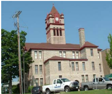
Cass County Building, Cassopolis Site of Freedom Road marker