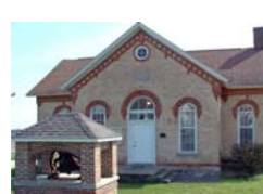
Mason District # 5 School