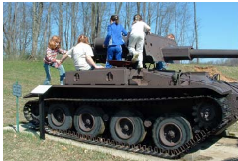
Marcellus VFW Military Museum